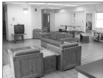
A peek inside the Therapeutic Group Home

Research shows that, in general, the healthiest kids are those that are brought up in a safe and loving environment. Usually that is found in a home with a nurturing family, but for youth suffering from mental illness, emotional difficulties, behavioral problems, chemical abuse issues, or symptoms of trauma, sometime more help is needed. That is when a local therapeutic setting like the Lavrich Center becomes a lifeline, to the child, and their family. Before the therapeutic model was available here teens had to be sent to residential placements out of the county. Often the placement created even more problems than it solved. Children had to adjust to new faces, new schools, and a new living environment. Parents often were unable to attend treatment meetings and participate in their child's recovery due to the distances involved. Finally, when discharged the teen would come back to the county and complete their aftercare with a new counselor in a new agency. Many times youth would receive excellent treatment in out of county placements, only to return home to an unchanged environment and no supportive treatment. Fortunately, more choices are now available.