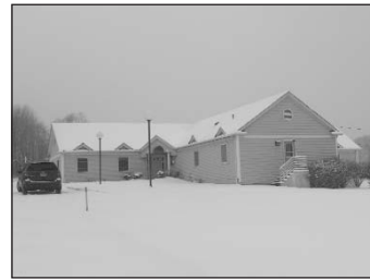
Therapeutic Group Home

Board of Mental Health & Recovery Services. This action helped ensure that the Youth Center will continue to operate as a local therapeutic treatment program for Geauga County teens throughout 2008.